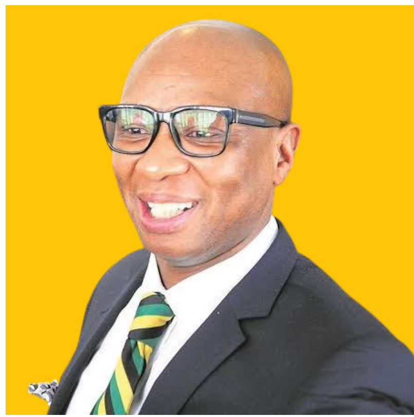
Cde Zizi Kodwa