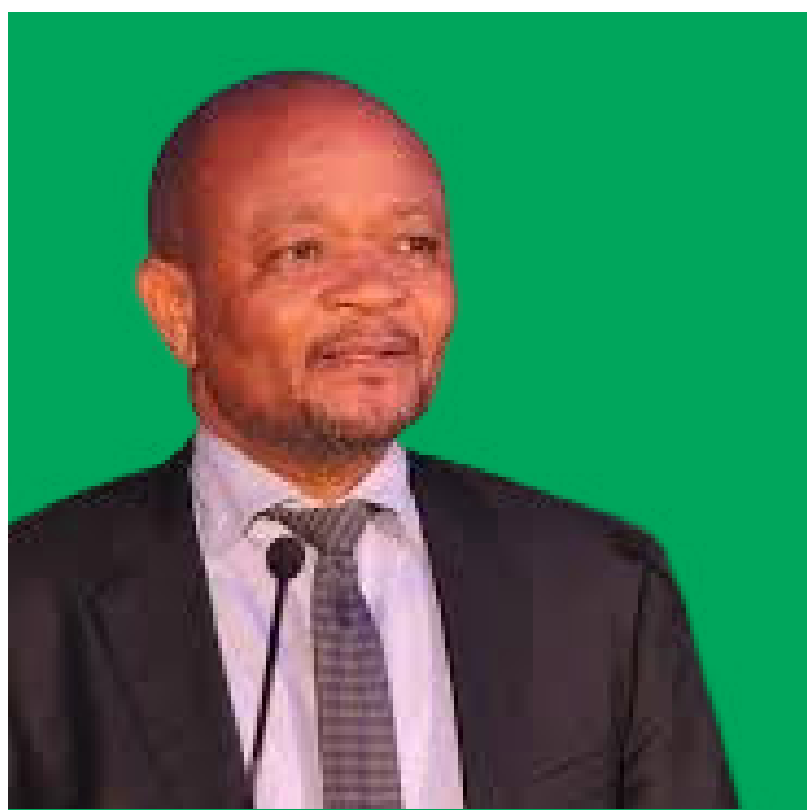
Cde Senzo Mchunu