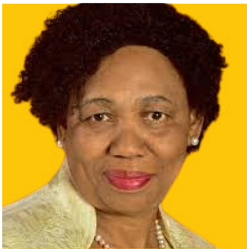
Cde Angie Motshekga