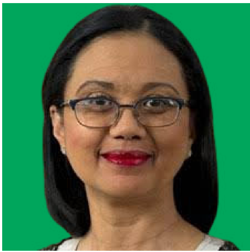
Cde Tina Joemat-Pettersson