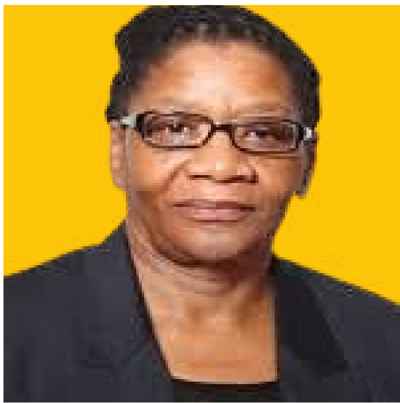
Cde Thandi Modise