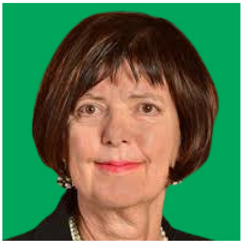
Cde Barbara Creecy