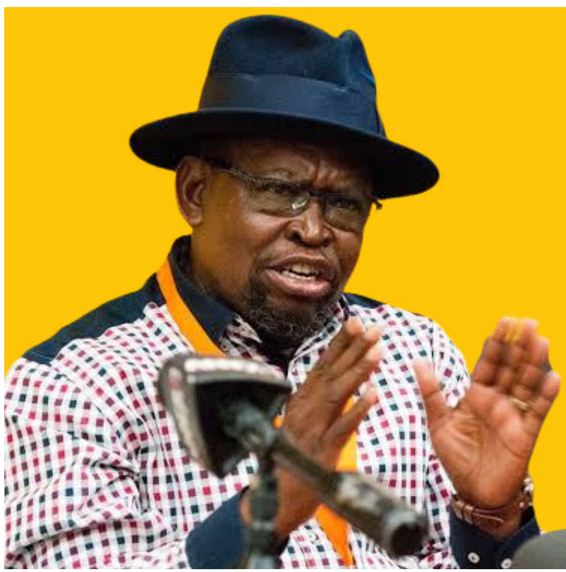
Cde Enoch Godongwana