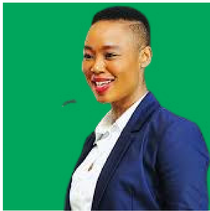
Cde Stella Ndabeni-Abrahams