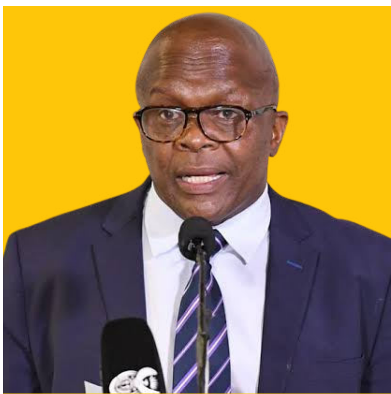
Cde Mondli Gungubele