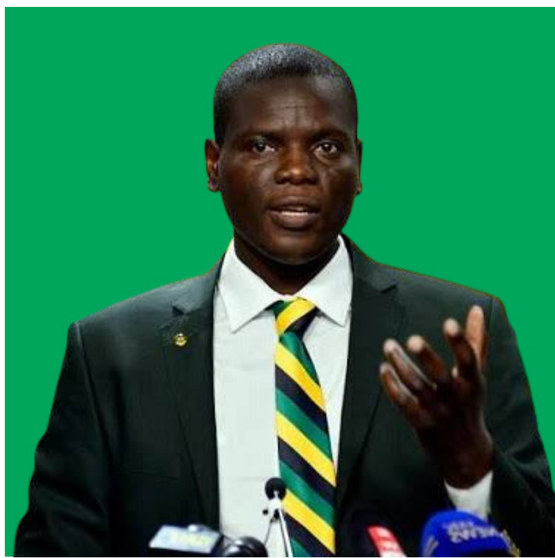
Cde Ronald Lamola